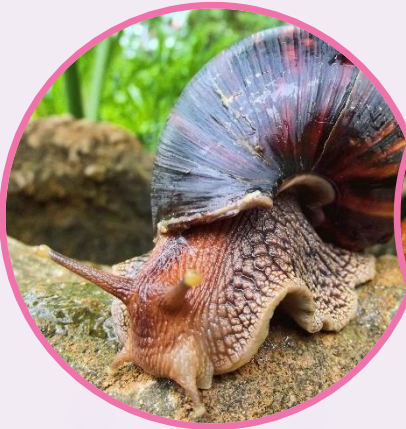
African land snail

These animals need lots of special care to keep them happy and healthy.